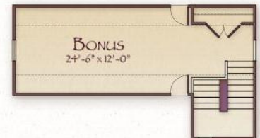
3rd Floor Bonus Room +484 Sq. Ft.