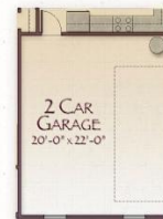
Side Entry Garage